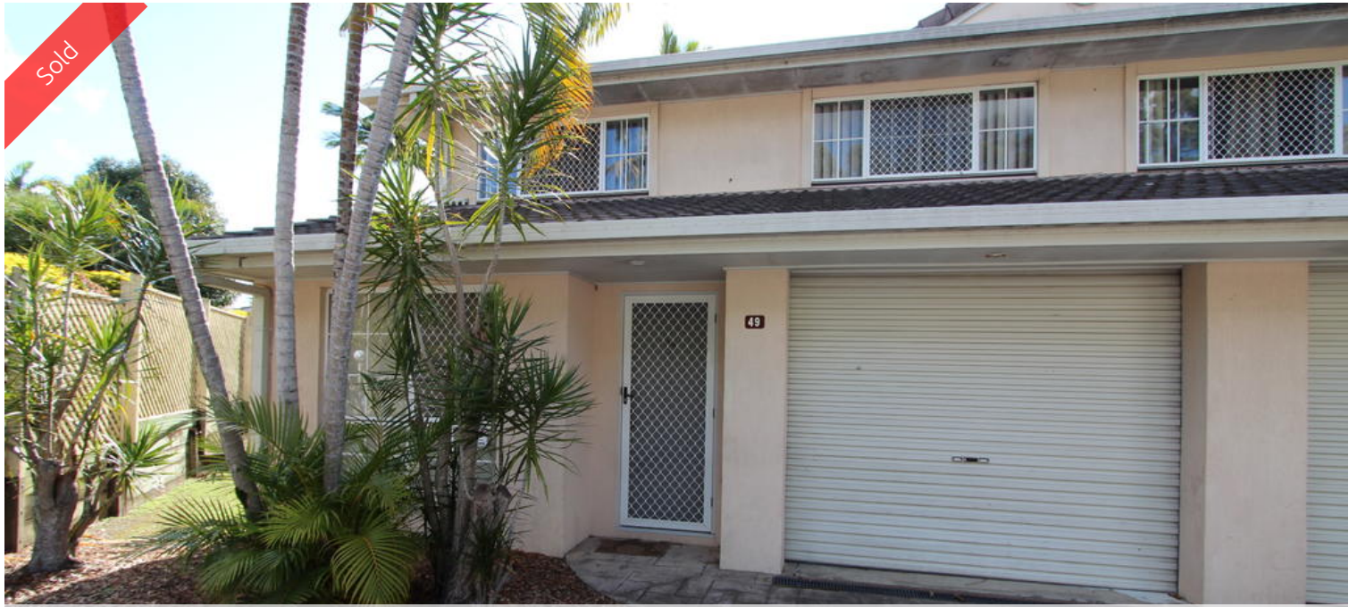
Unit 49, 45 Nyanza St, Woodridge